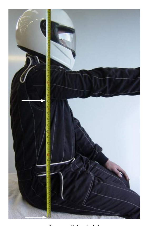
Arm pit height.

Driver to sit on the flat surface in a good upright position for accurate measurement. Driver to hold right arm out straight, making sure shoulders are level viewed from behind. Measure from flat surface to centre of armpit.