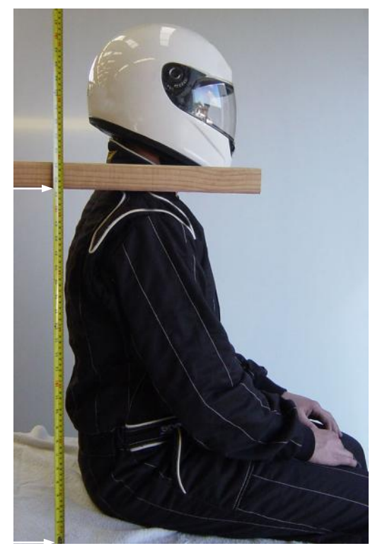
Shoulder harness height

The measurement we want is from the position that the harness sits on. Make sure you list the type of head and neck restraint that you intend using, we will add some to allow for this.